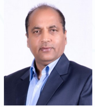
Shri Jai Ram Thakur Hon'ble Chief Minister, Himachal Pradesh