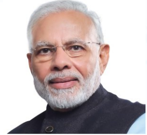
Shri Narendra Modi Hon'ble Prime Minister of India